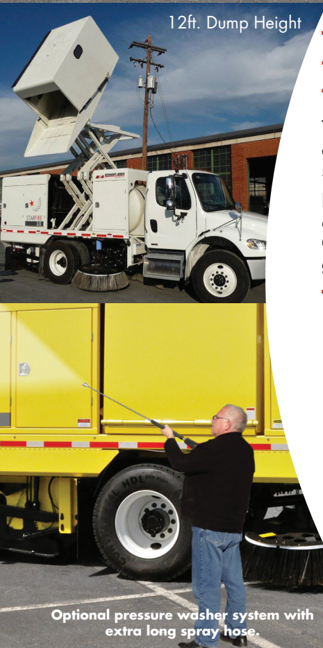
12ft. Dump Height

The preferred balance of performance, reliability and capacity, the Stewart-Amos Sweeper Co.'s Starfire S-5t is a powerhouse for your most rigorous sweeping applications.