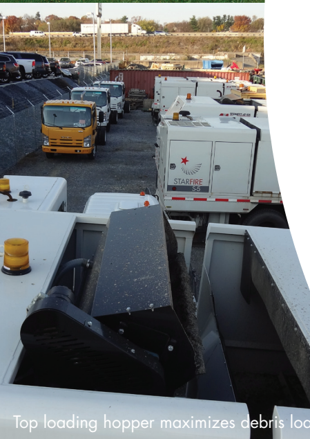
Top loading hopper maximizes debris loading.

Stewart-Amos Sweeper Co.'s Starfire Sweeper Series - The Powerhouse in Broom Sweepers