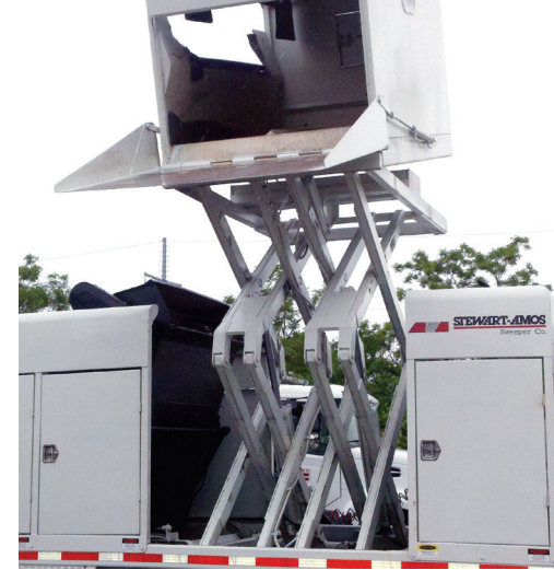
Massive quad (4) "X" style lift scissors with four corner lift provide exceptional hopper stability especially when dumping wet, unbalanced or sticky debris.